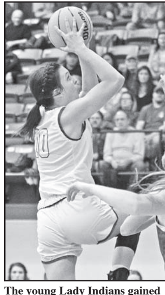
The young Lady Indians gained valuable experience in 2021-22.

Following a Monday night rematch with Taliaferro on Nov. 21, Towns will travel to Union County on Tuesday, Nov. 22.