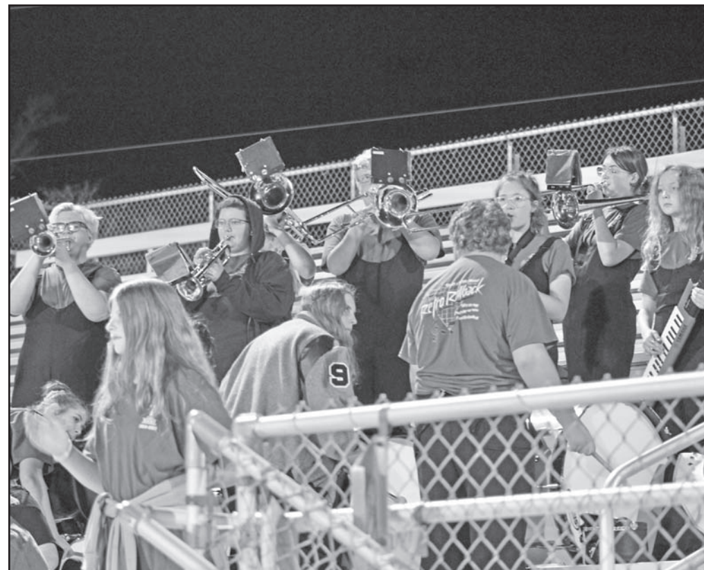
Members of the Towns County High School Indian Raider Band made the trip to Lincoln County for last Friday's season finale.

large senior class I think we are going to be able to rely on that's battle-tested and with a lot of grass time. So, we are going to